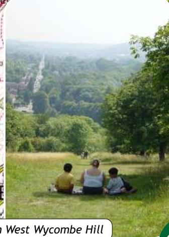
View from West Wycombe Hill