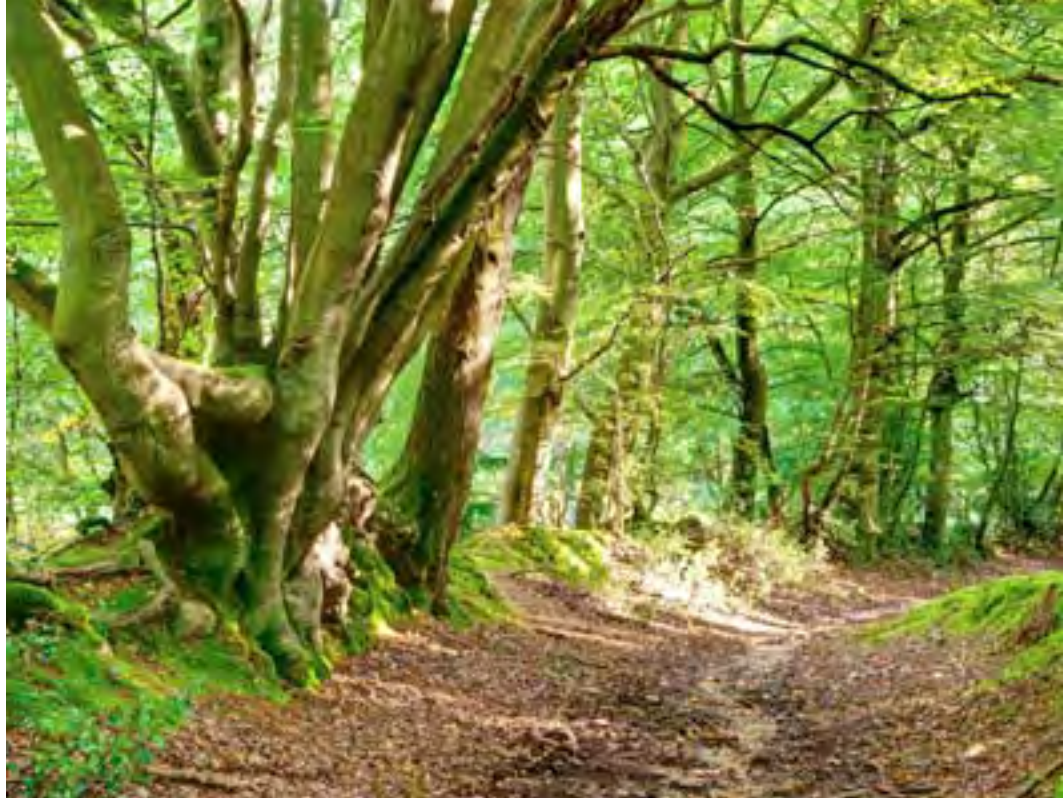
Kingwood Common Oxfordshire