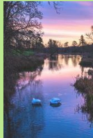
Winter sunrise, Latimer Chess Valley