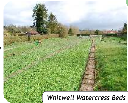
Whitwell Watercress Beds

attractive village with two pubs. Nine Wells Watercress Farm is one of the few remaining watercress farms in the area and can be seen from the road. They have been growing watercress here for 200 years and it is still hand-cut.