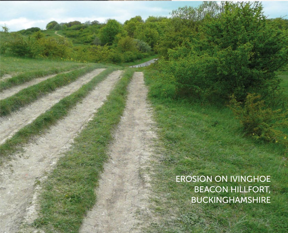
EROSION ON IVINGHOE BEACON HILLFORT, BUCKINGHAMSHIRE