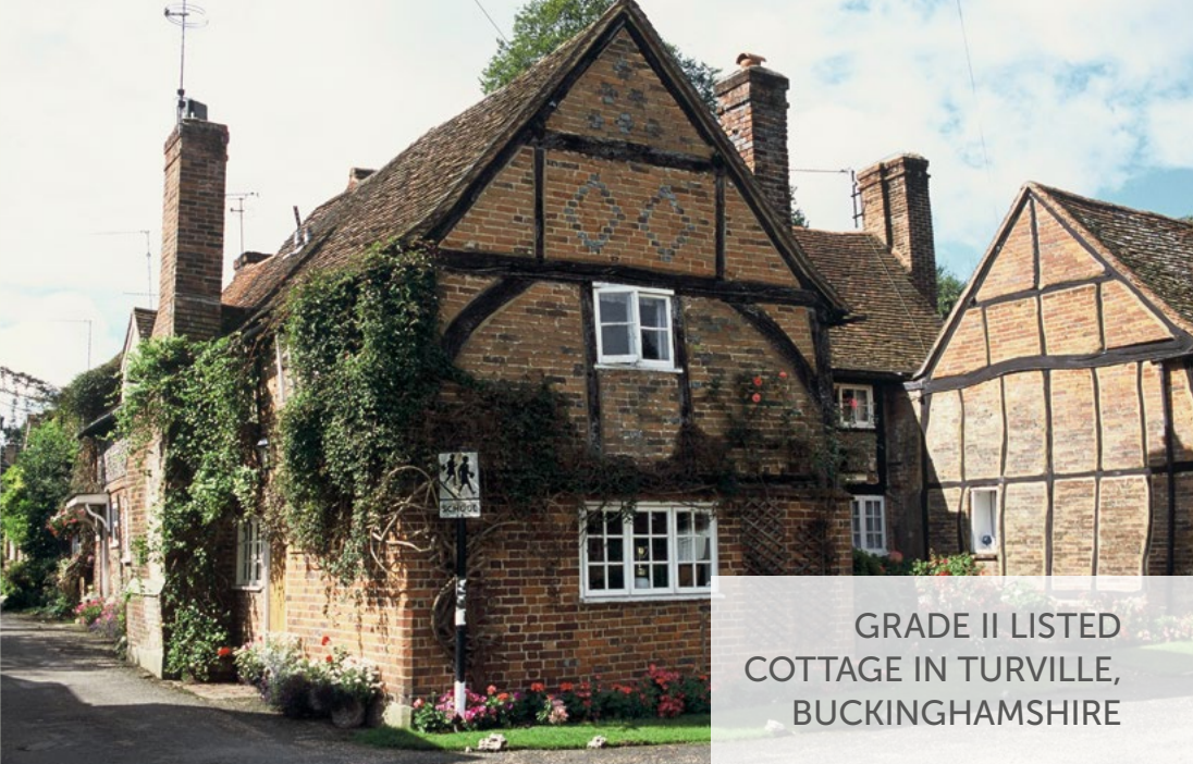
GRADE II LISTED COTTAGE IN TURVILLE, BUCKINGHAMSHIRE